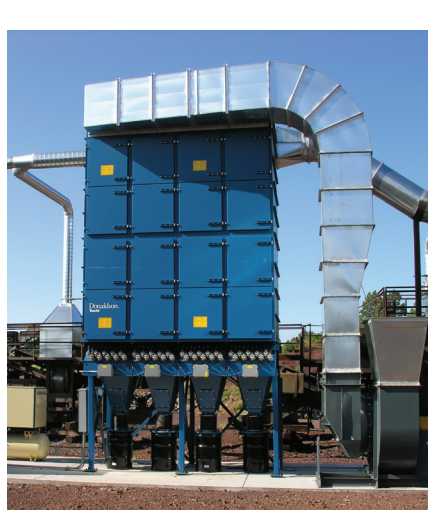
DALAMATIC® DUST COLLECTOR