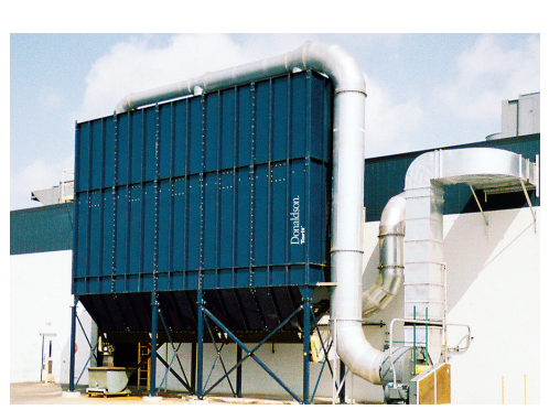
MODULAR BAGHOUSE COLLECTOR