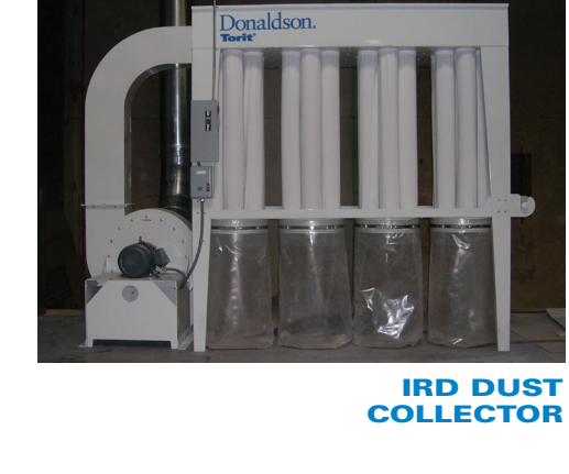
DURA-LIFE Twice The Life Filter Bags