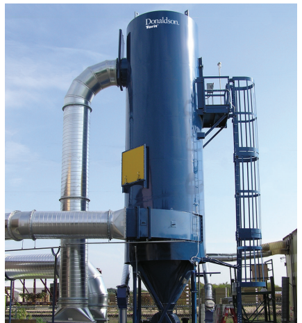
RF DUST COLLECTOR