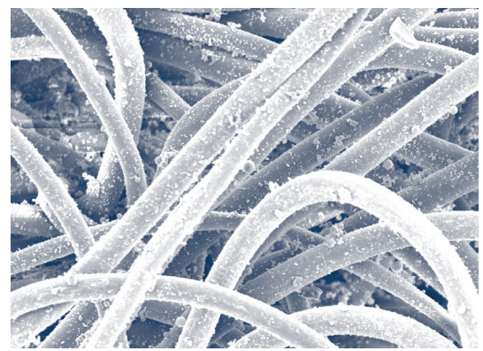
Needled Polyester Bag Clean Air Side (300x)

Dura-Life bag filters are engineered with a unique hydro-entanglement process that uses water to blend the bag fibers, creating a more uniform material with smaller pore size that provides better surface loading of dust and prevents penetration deep into the media. In contrast, conventional polyester bags are manufactured with a needling process that creates larger pores where dust can embed into the fabric, inhibiting cleaning and reducing bag life. With better surface loading, Dura-Life bags provide improved pulse cleaning and a lower pressure drop, which results in extended bag life, less maintenance time and cost, energy savings and greater filtration efficiency.