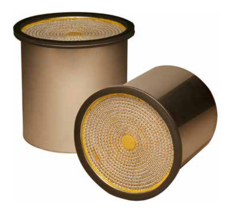
Ultra™ Cylindrical HEPA Filters